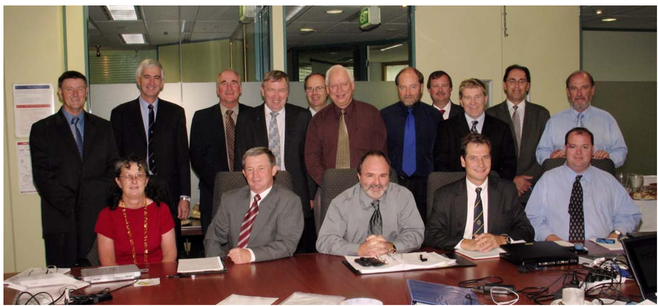
Delegates to the last ICSM biannual meeting, March 2006

ICSM comprises representatives from Australian and New Zealand government surveying and mapping agencies ICSM is a Standing Committee of ANZLIC – the Australian and New Zealand Spatial Information Council